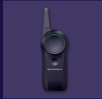
PMUF1983 CURVE RADIO