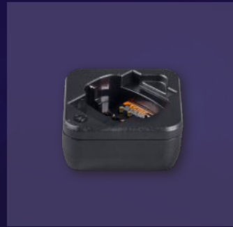
PMPN4587 SINGLE-UNIT CHARGER