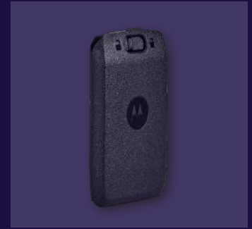
HKNN4013ASP01 BT90 STANDARD CAPACITY BATTERY